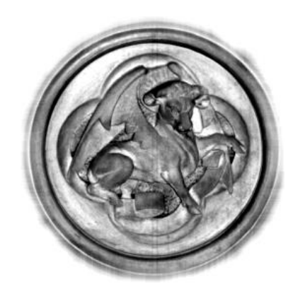
Winged bull of St. Luke - one of the badges on the pulpit